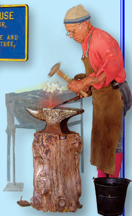
The Village Blacksmith