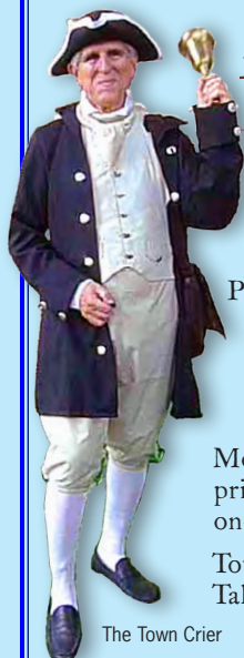
The Town Crier